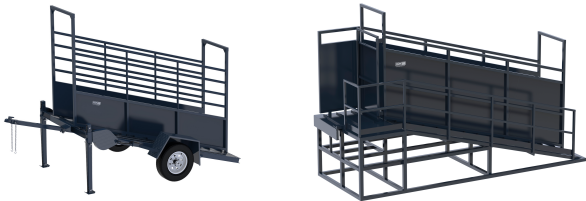
ELITE PORTABLE & STATIONARY LOADOUT CHUTES